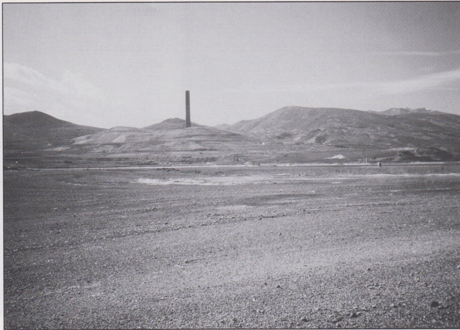
Anaconda Montana – an old smelter. Note stark, bare landscape.