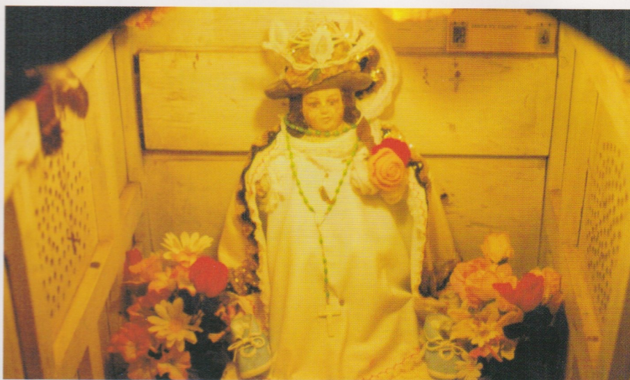
El Santo Niño - the Child King.