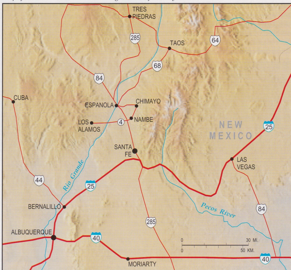
Map of Northern New Mexico showing location of Chimayo.

CARTOGRAPHY/GIS LABORATORY, DEPT. OF GEOGRAPHY/EARTH SCIENCE, UNIV. OF WISCONSIN-LACROSSE