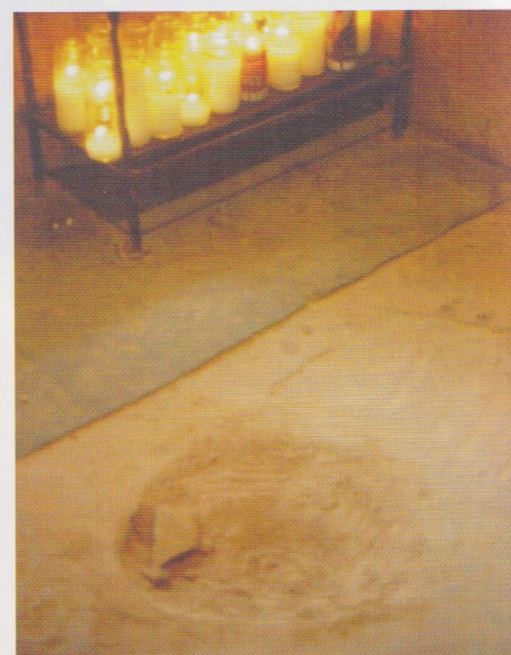
El Posito - the source of the sacred dirt.