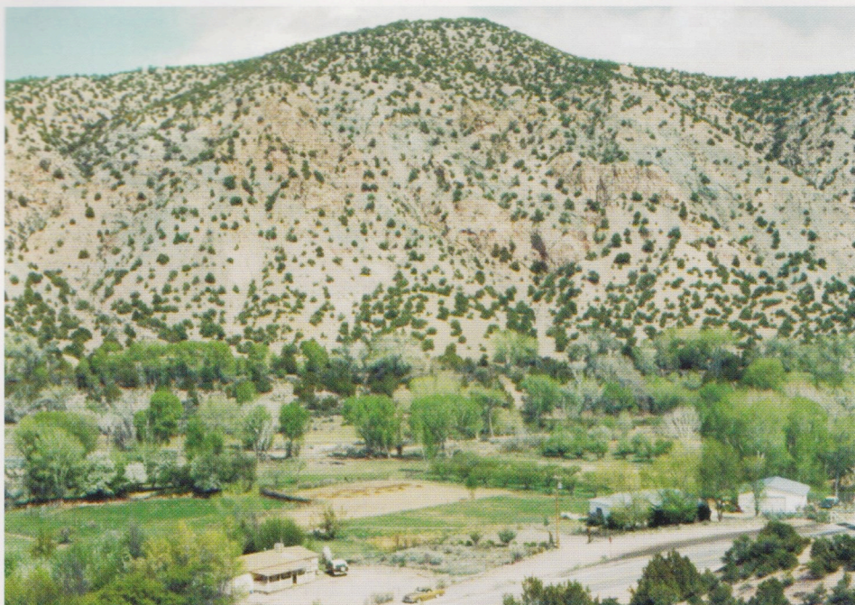
Rural life in Northern New Mexico: the Chimayo landscape.

towers rise above a modest rectangular chapel. Low adobe walls surround the courtyard and a dozen gravestones. A small acequia (irrigation ditch) meanders around the front of the building. Out back, a creek completes the fluid circle. Stations of the Cross have been marked beside the furrowed trunks of a dozen tall cottonwood trees. In the fall, bright yellow leaves float onto open air benches where the devout attend mass while magpies swoop and sing overhead. Cooing pigeons chime in from the vernacular chapel's shadowy eaves. Horses and cows stroll and graze across the