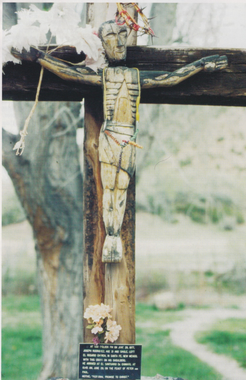
A seventy pound cross carried thirty miles to el Santuario by a pilgrim.

although separate at their cores, became interwoven around the church.