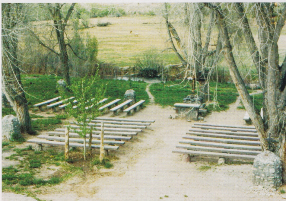
Open air services are held out back beside flowing water and cottonwood trees.

El Cristo Negro was carved from balsam and orange wood. Its brown color quickly turned black from the smoke of countless candles and incense burners placed at Christ's bleeding feet. By 1595, the crucifix was placed in a chapel built at the former site of an Indian shrine known for its clear, flowing springs. Miraculous healings began to be reported by those praying to the figure. Pilgrims descended from cloudy, mountain refuges to seek comfort against the disease and want of colonialism. Geophagy - earth eating - had long been practiced by the Mayans as a source of trace minerals and spiritual medicine. The increasingly mestizo population of Guatemala quickly melded Catholicism and Indian belief into a melange of practices. Clay cakes, "tierra de Santo" or "benditos," were made, and each adorned with the image of the Nuestro Señor de Esquipulas. The cakes were sold to pilgrims who ate the dirt as a form of sacrament. Spanish and Mayan cultures,