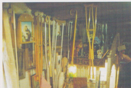
Crutches and canes left behind by the healed.